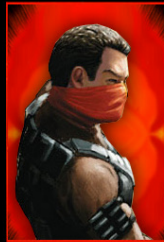
SKULL SQUAD TROOPER